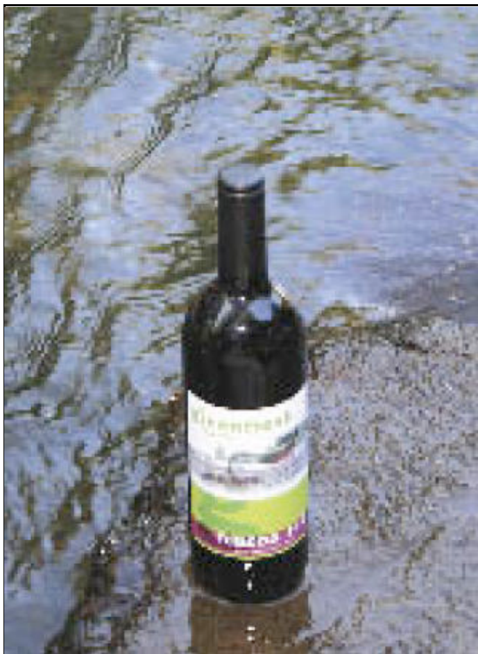
“Greenfresh Market Renton Red” wine